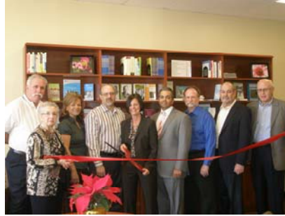
Cancer Support Center at 1890 E. Florence Blvd., Ste. 4 (east of Casa Grande Regional Medical Center) is now open to aid support individuals and families.