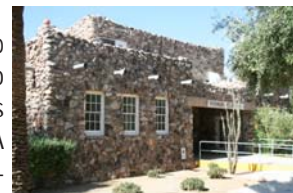
Women's Club Pueblo Revival Style Built 1924 National & Local Historic Registers