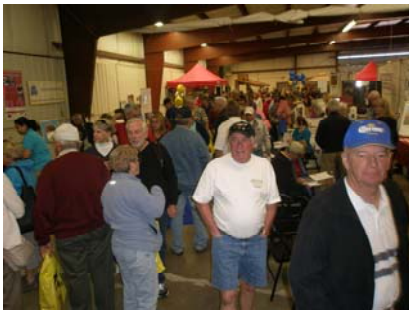
The Greater Casa Grande Chamber of Commerce Home, Health & Garden Show drew an attendance of more than 2,000 to the Pinal Fairgrounds & Events Center .