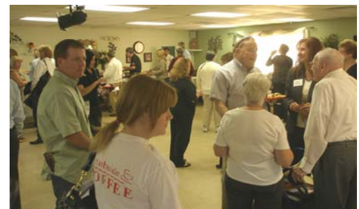
Red and white balloons marked the way to the January Business After Hours co-hosted by Casita Verde RV Resort and Golden Eagle Distributors, Inc. The event was held in the club house of the resort, 2200 N. Trekkell Rd.