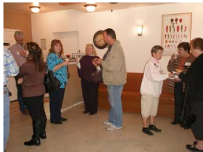
A great networking event, the monthly Business Before Hours was hosted at the Big House Café & Catering , 104 E. 4th St. (520) 836-0041